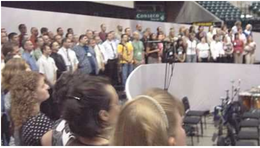
Candidate Choir ~ rehearsal